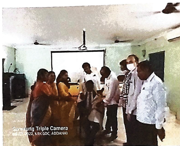
Felicitaton to the Principal sir